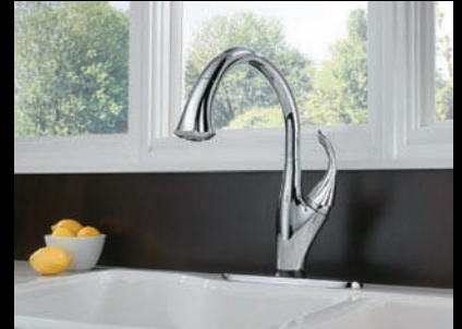
Single-Handle, Pull-Out & Pull-Down Kitchen Faucets