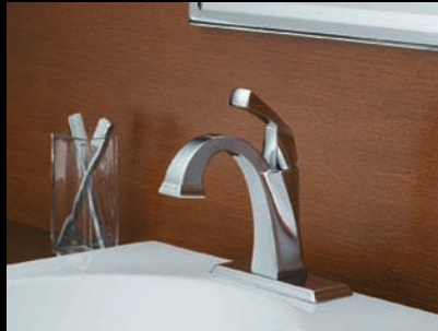
Single-Handle Lavatory Faucets