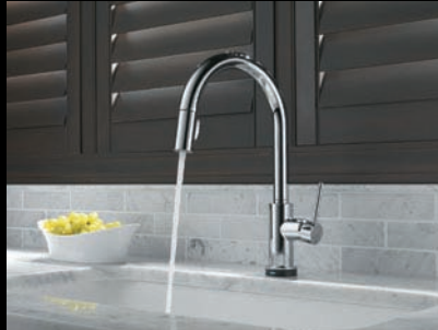
Touch 2 O Technology Kitchen Faucets

Pull-down faucets from traditional to contemporary style. Lavatory models in single-handle or widespread. Touch 2 O ® and Touch 2 O. xt ™ Technology faucets. You'll find DIAMOND ™ Seal Technology in a variety of faucet configurations, and in nearly every style or functionality that Delta Faucet offers.