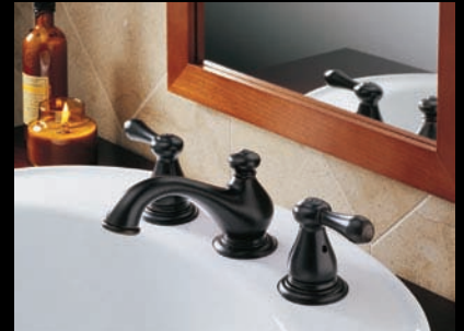
Widespread Lavatory Faucets