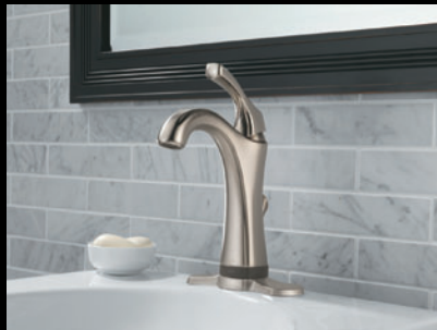
Touch 2 O. xt Technology Lavatory Faucets